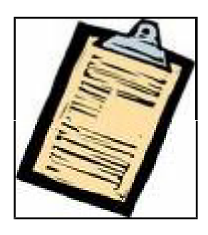
Forms: Participant Info, Medical Release, etc.