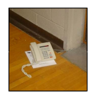
Access to a Telephone and 9-1-1 Script